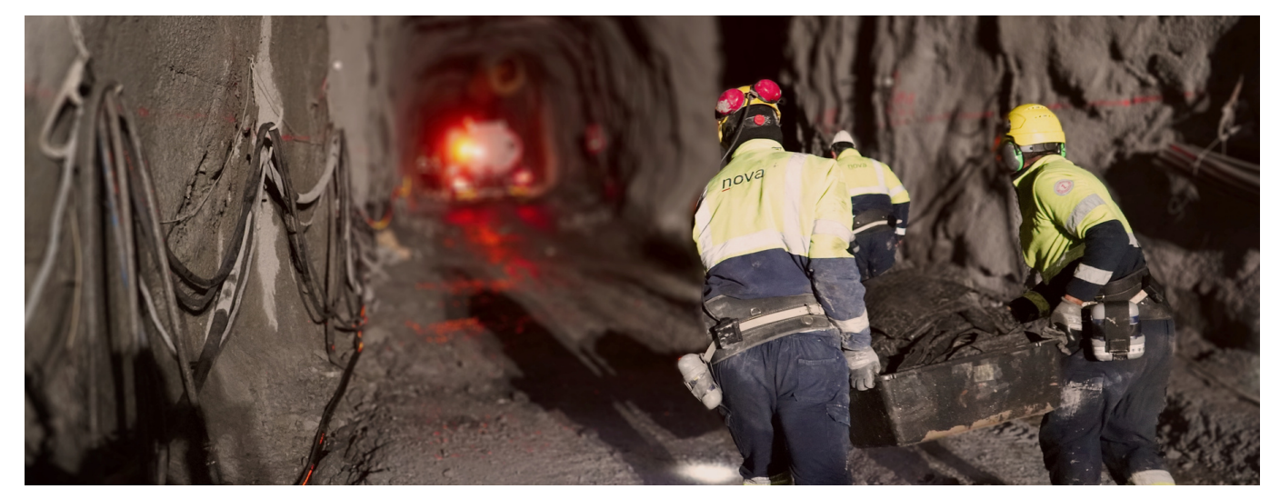
As an important segment of the said decision, there is support for the local community, specifically for the employees of Nova Mining who will continue their professional journey within the company Adriatic Metals BH. With this move, Adriatic Metals BH confirms its social responsibility and alignment with the needs and aspirations of the community.

The transition is expected to yield tangible benefits, including cost reduction, enhance efficiency and drive sustainable growth in the long term. Streamlining operations means stability, and Adriatic Metals BH is committed to acknowledging all the contributions, loyalty, and established relationships. As the sole operator of the mine Rupice, Adriatic Metals BH reaffirms its dedication to excellence, innovation, and responsible stewardship.